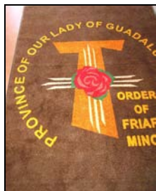
Carpet with the provincial seal