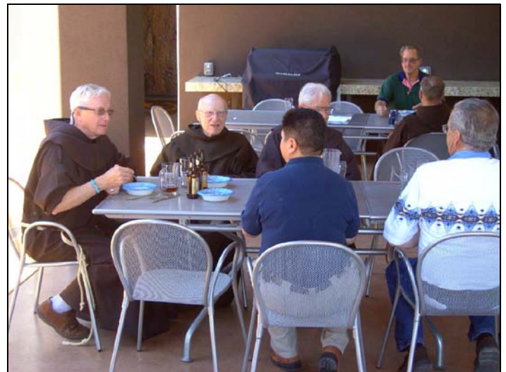
Cincinnati and New Mexico Chile served in the dining room and the patio