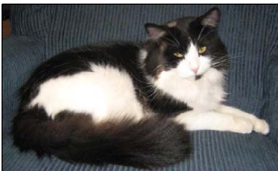
Mr. Friendly: waiting to catch Father Terence's goldfinch

His main interest and daily duties center on the birds - the ubiquitous sparrows, the busy finches, the bullying redwing blackbirds, the helicopter hummingbirds. You can see them all right out the dining room window, where Terry watches a few minutes each morning.