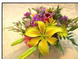
Bouquet on the altar with all the colors of the new friary