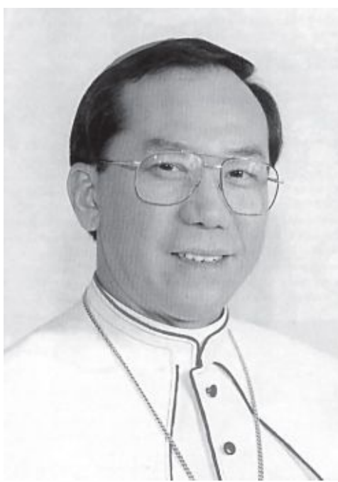
Bishop Crisostomo Yalung

In these two instances, the Vatican acted swiftly, although those in the local Church had long been ignoring the signs.