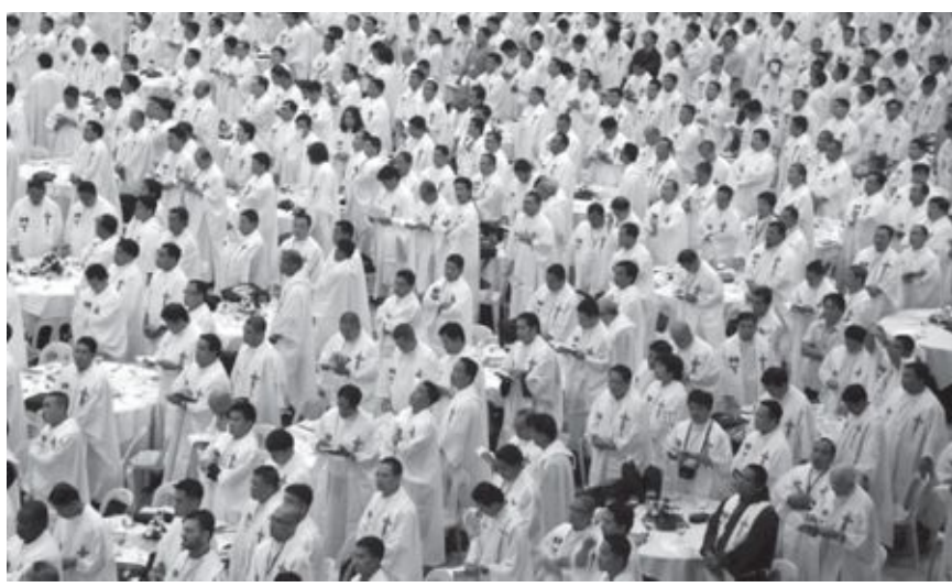
Priests during a plenary assembly

A few of these closet fathers had voluntarily left the priesthood and gotten married. Some became politicians.