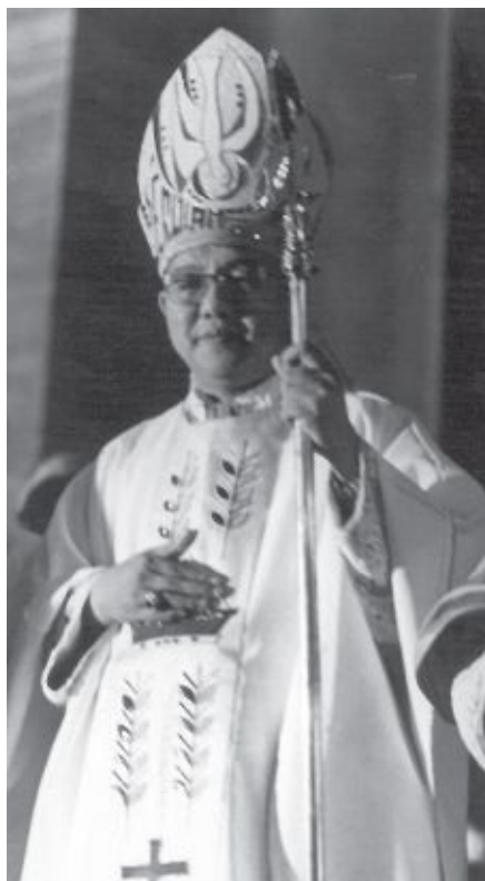
Jaime Cardinal Sin