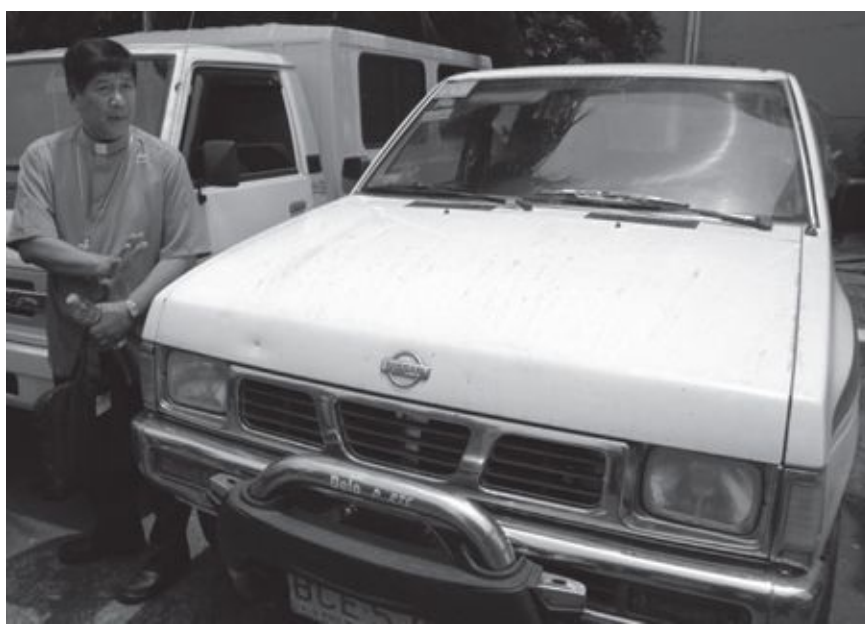
One of the PCSO vehicles 'donated' to the bishops

The internal division surfaced after martial law was declared. The administrative council of the CBCP (the precursor of the CBCP Permanent Council) in a September 26, 1972 statement, sought for “self-examination” by the public, that is “how far each one is contributing to the evils that beset our country and have given rise to the very issue of martial law.” The statement also expressed satisfaction over Marcos’s assurance “that he was concerned not to prolong martial law unduly. We, too, echo this desire.” 15 Marcos did just the opposite.