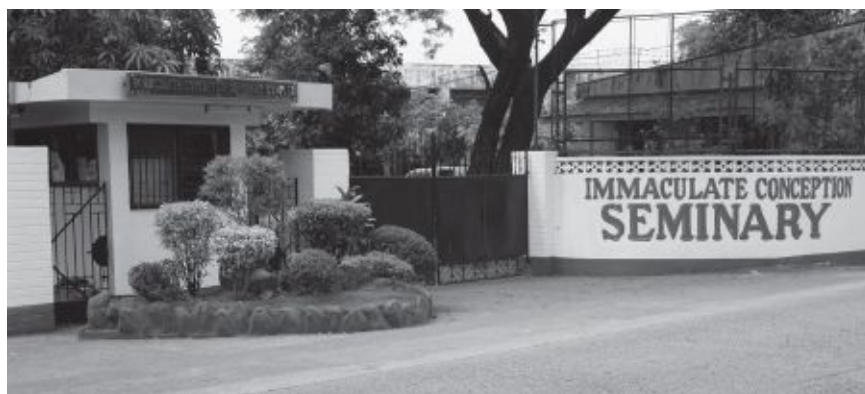
Scene of the crime.

When I pressed on, he said: “If you are going to besmirch me, I hope you won’t. I am about to die and [am] just waiting for the Lord to take me,” he said, avoiding my gaze and looking directly at the statue of Our Lady. “I hope you won’t come up with the story.” Then, showing me ten beads on his rosary, he said, “I’m offering these ten Hail Marys for you.”