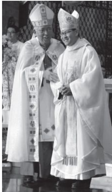
Retired Gaudencio Cardinal Rosales passing the torch to Luis Antonio Cardinal Tagle.