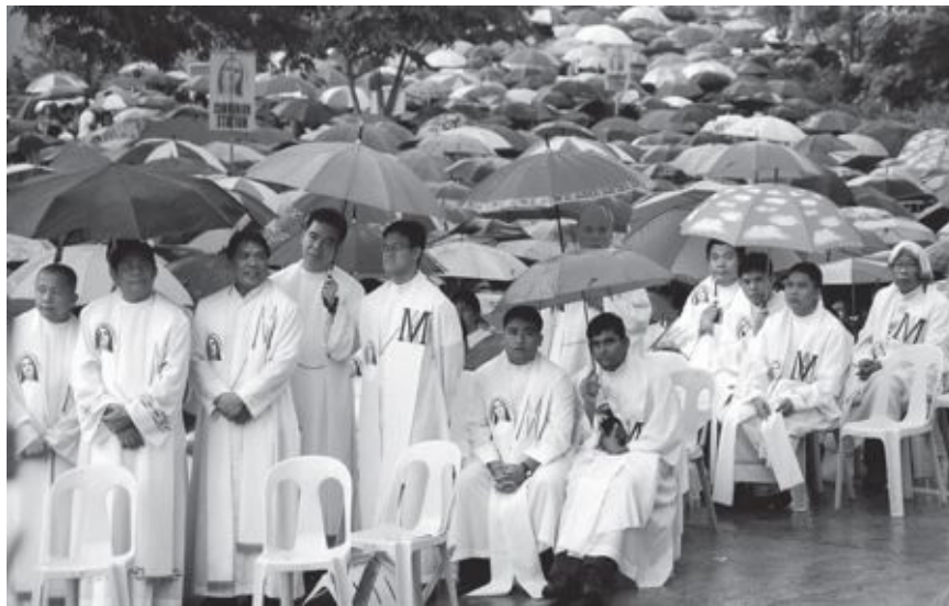
Priests join rally vs RH

It was as if there were two parallel universes—one was where the surveys reflected reality and the other was where whatever the self-appointed moral guardians said was the reality.