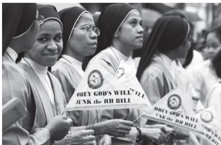
Nuns rallying vs RH

Early in his term, Flavier served notice that he would be serious in combating the spread of AIDS which had started to rear its ugly head. He anchored his campaign on three letters: ABC, which stood for Abstinence, Be Faithful, and Condoms.