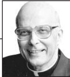
FRANCIS CARDINAL GEORGE, OMI Archbishop of Chicago