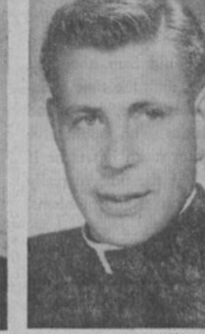
on the Seattle University