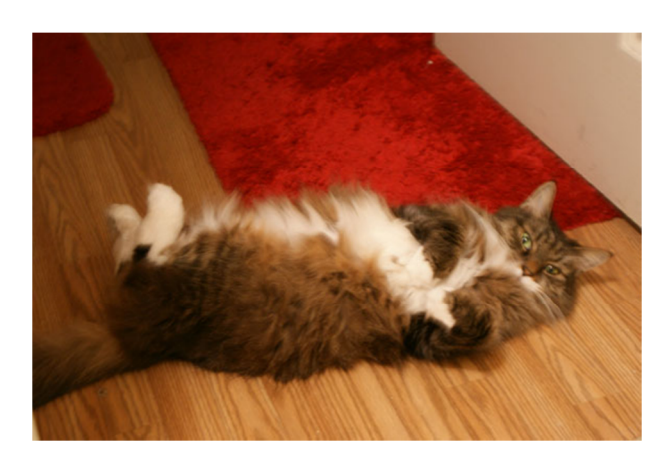
This is "Poppy" [Need I say more...]