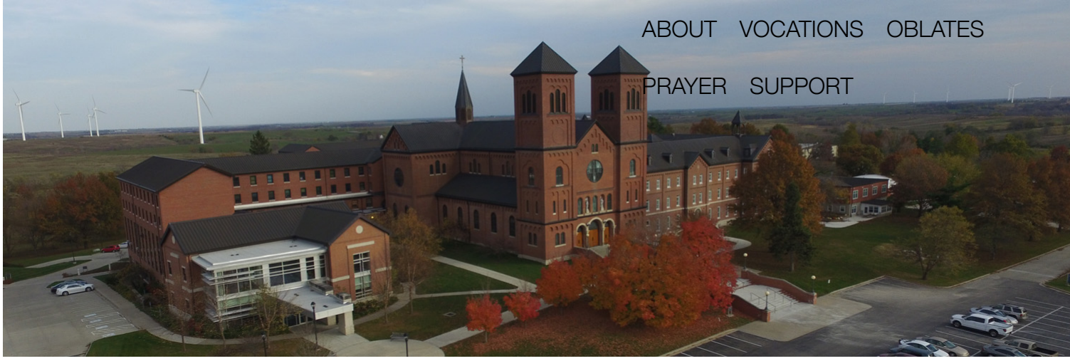
Thursday, Jun. 29th 2017