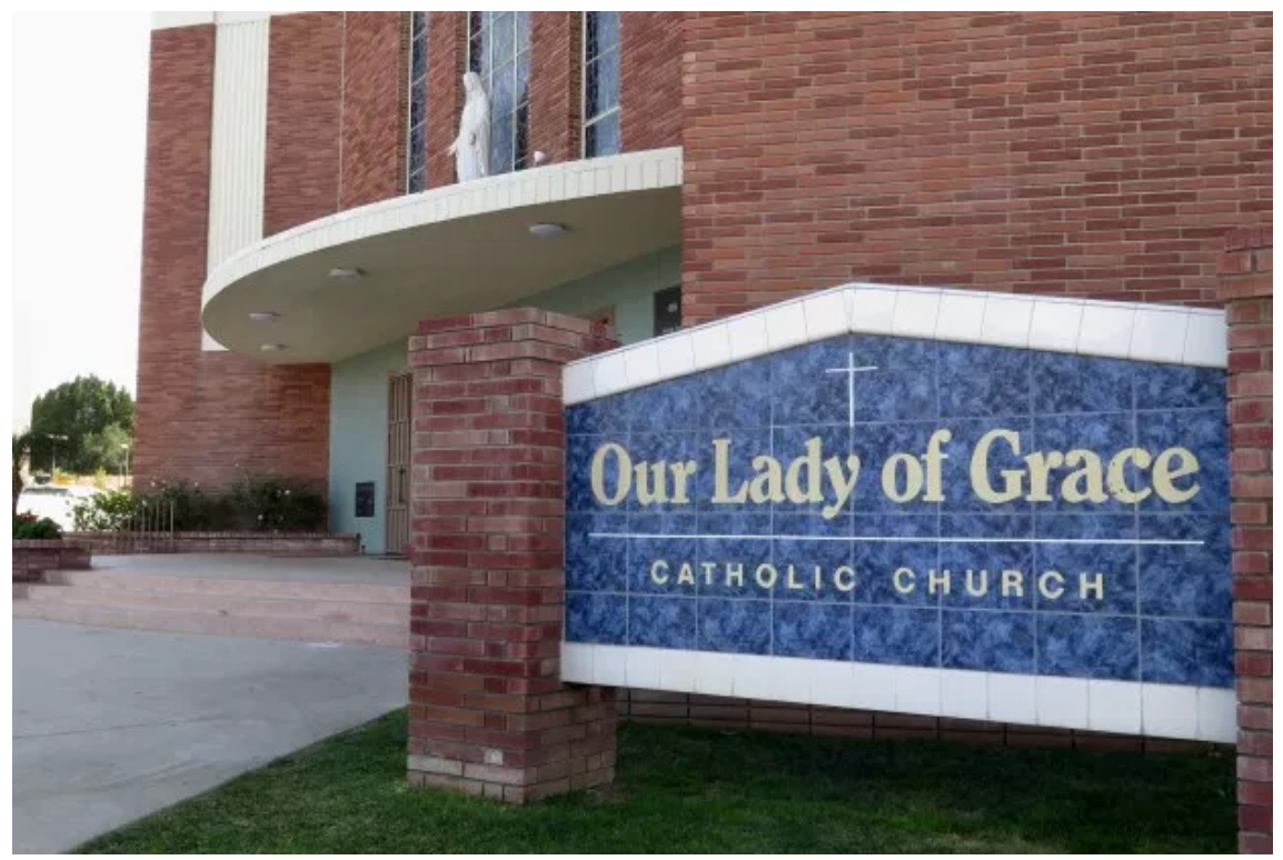
Our Lady of Grace Catholic Church in Encino, photographed Monday, Jan. 29, 2018.