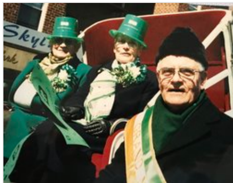
Added by Anonymous