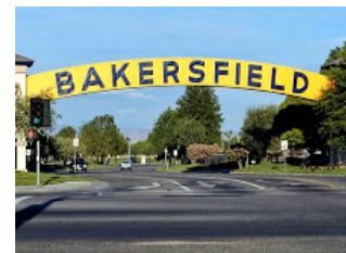
Famous Bakersfield arch