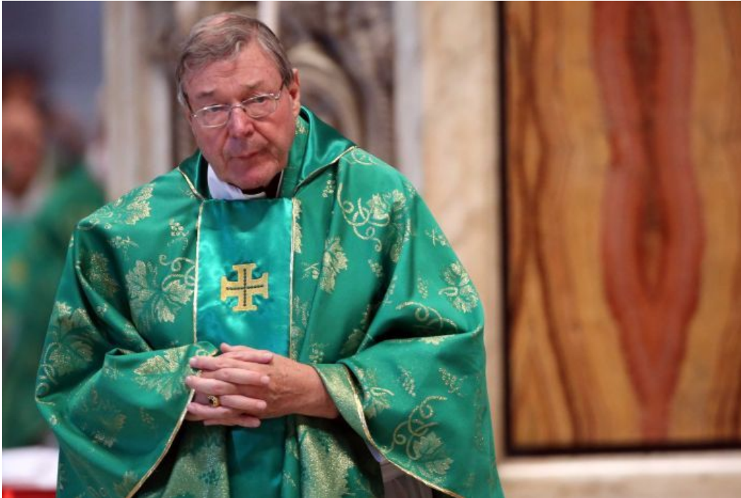
PHOTO: Cardinal George Pell was at the centre of Royal Commission hearings into the Ballarat Diocese (Getty Images)

When local businessman Les Tyack walked into the Torquay Surf Club change rooms one day in the summer of 1986-87, he encountered a scene that struck him as "very odd" — George Pell with three boys he estimates were aged between 8 and 10.