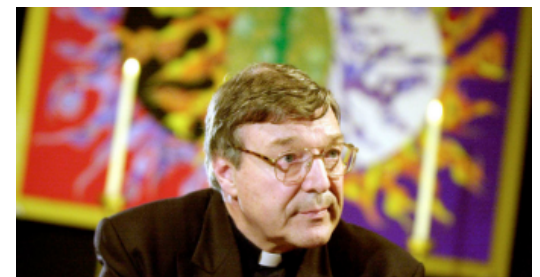
Cardinal George Pell is one of the most prominent and controversial figures in the Australian Catholic Church. Look back at his career.