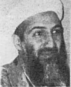
HUNTED: bin Laden.

However, the ceremony was overshadowed by reports that US warplanes had destroyed a convoy of tribal leaders travelling to