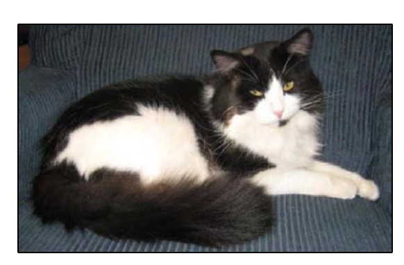
Mr. Friendly: waiting to catch Father Terence's goldfinch

His main interest and daily duties center on the birds - the ubiquitous sparrows, the busy finches, the bullying redwing blackbirds, the helicopter hummingbirds. You can see them all right out the dining room window, where Terry watches a few minutes each morning.