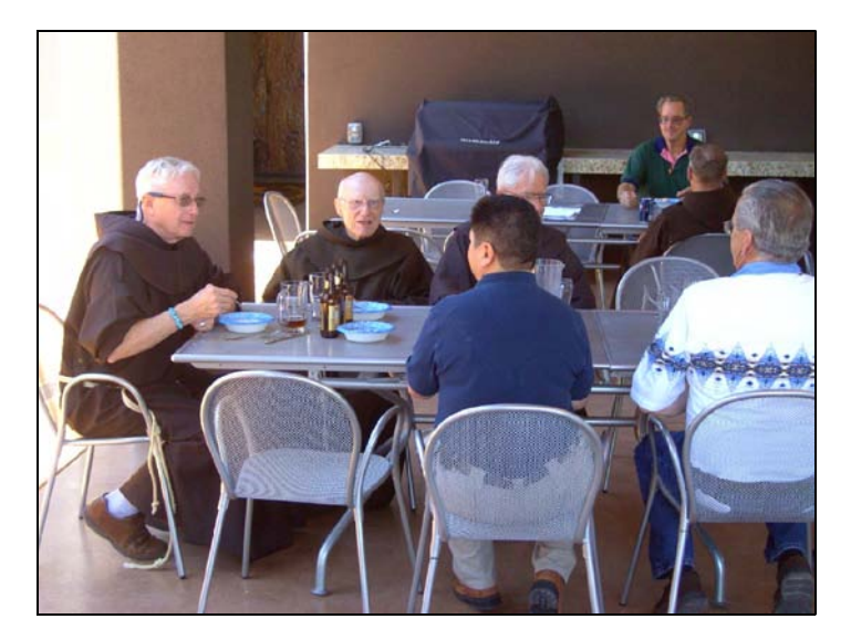
Cincinnati and New Mexico Chile served in the dining room and the patio