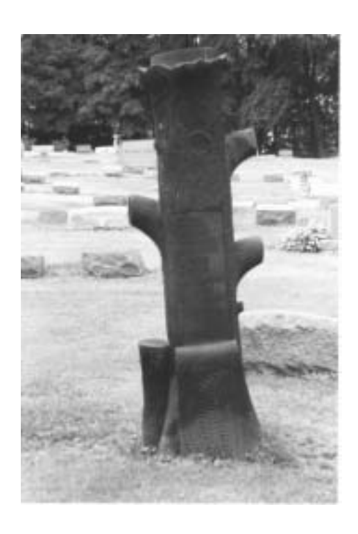
One of the early monuments was made to resemble a tree