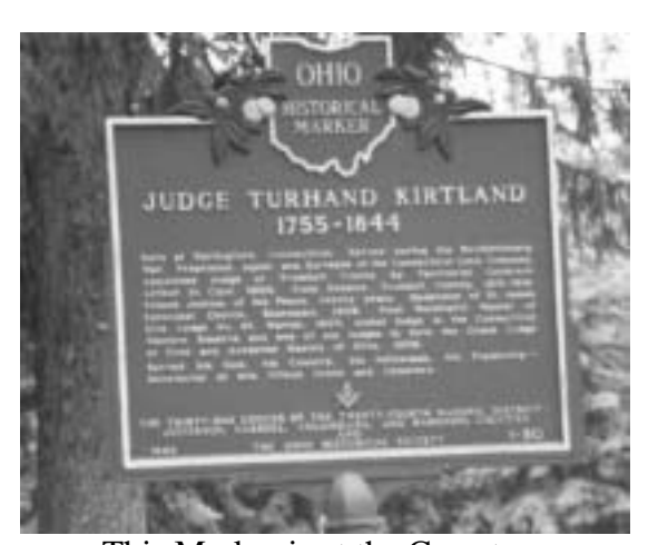
This Marker is at the Cemetery

The Presbyterian Church Cemetery is located next to the Presbyterian Church, in Poland Township, (Range 1, Town 1) in the old Western Reserve, southeast of the center of Poland