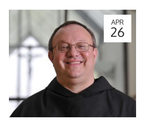
Augustinian Gala 2019 Apr 26, 2019 · The Drake Hotel