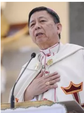
Archbishop Savio Hon Tai Fai

Byrnes' actions, with Hon's signed concurrence, also have the advice and support of the newly reconstituted Archdiocesan Finance Council and the Presbyteral Council, which is comprised of archdiocesan priests, San Nicolas said.