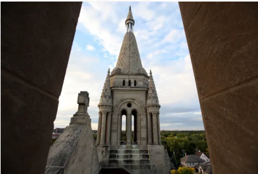
The south spire of the St. Joseph Cathedral.