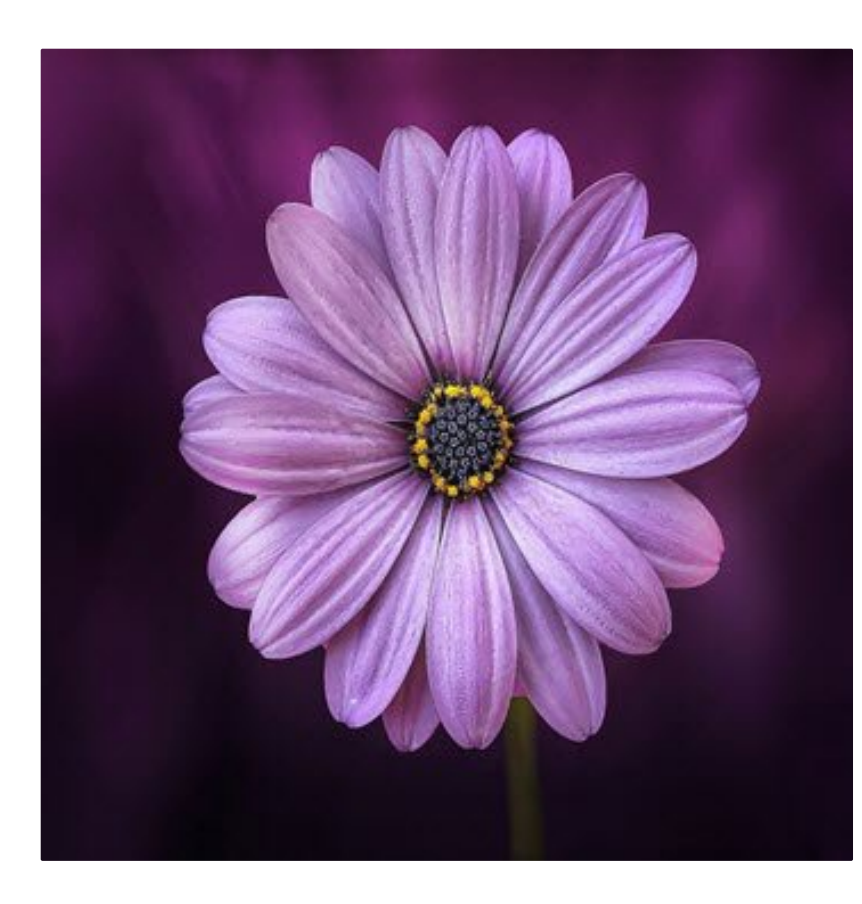
Funeral arrangement under the care of St. John Funeral Homes