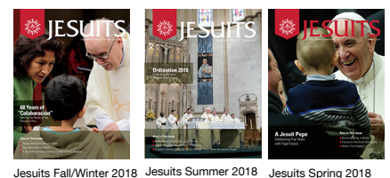
Jesuits Fall/Winter 2018 Jesuits Summer 2018 Jesuits Spring 2018