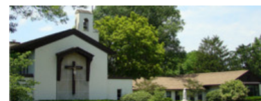
Jesuit Spiritual Center The Jesuit Spiritual Center at Milford spreads over 37 park-like acres overlooking the Little Miami River, 30 minutes east of Cincinnati.