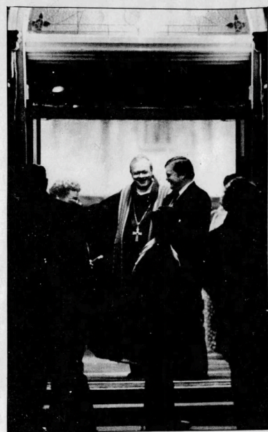
AFTER MASS: Bishop Keleher greets St. Boniface parishioners