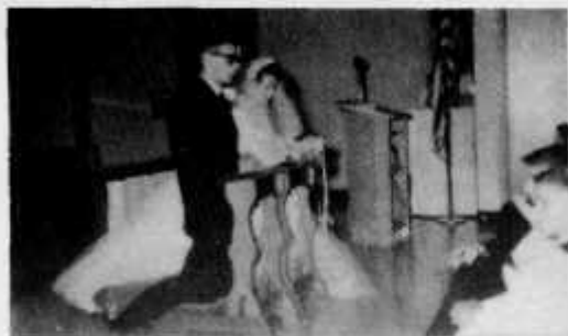
First Wedding in new Church

The new rectory is 100 x 32 ft. with the parish social hall in the basement.