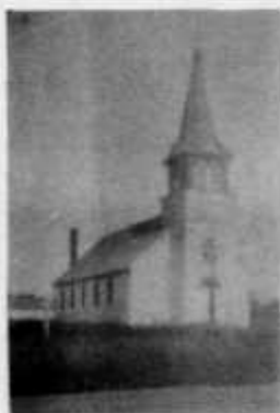
The First Church