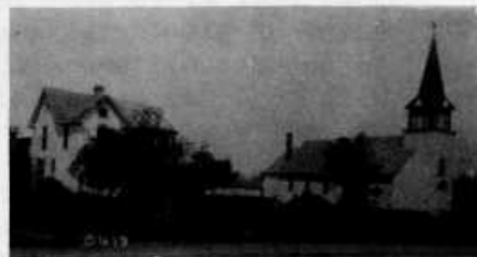
A early view of the first Church