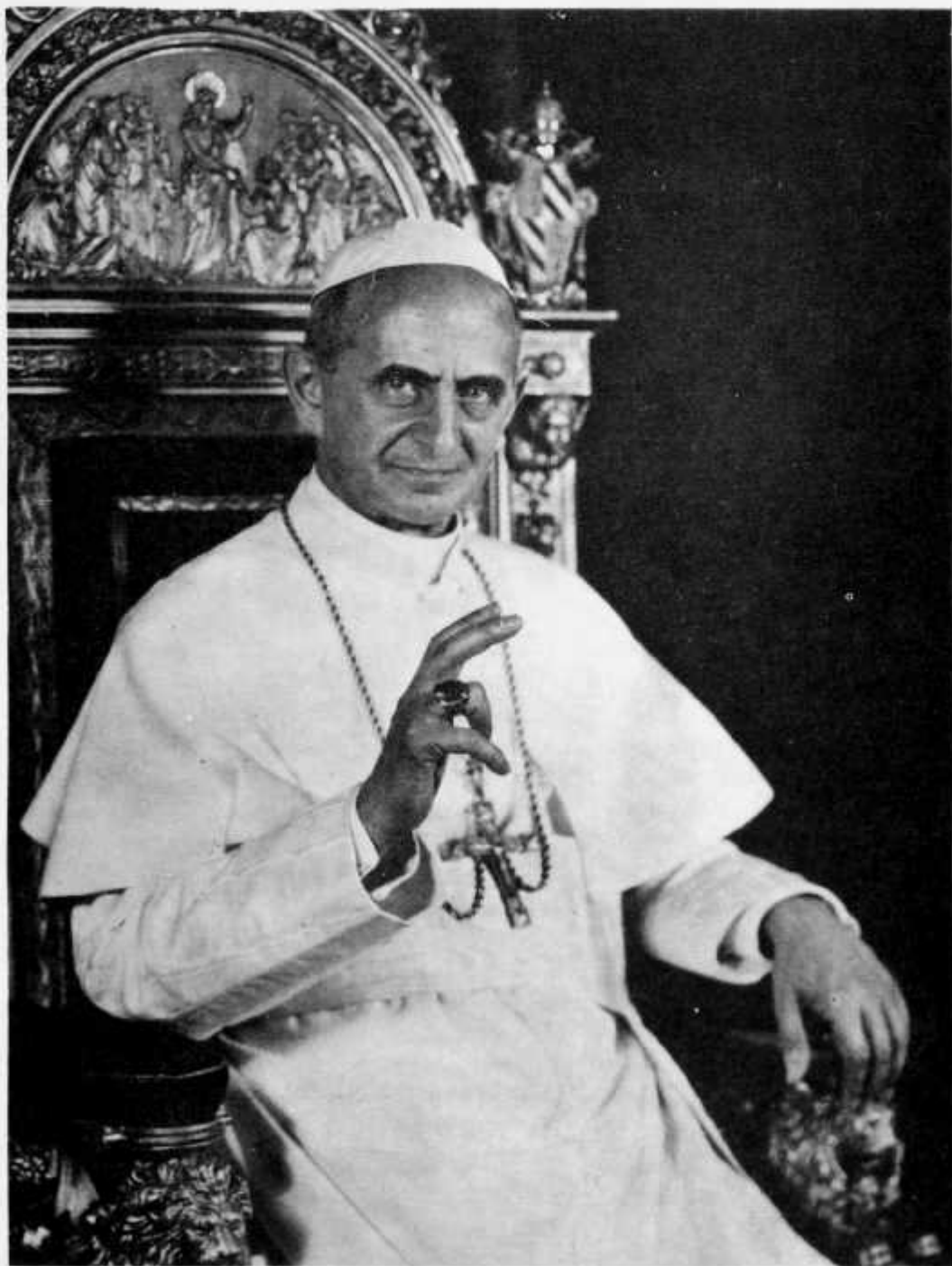
His Holiness Pope Paul VI