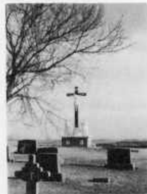
St. Francis Xavier Cemetery