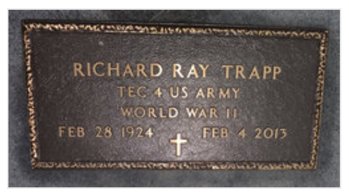
Added by UltiMikeS