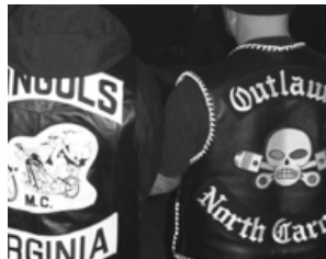
Infiltrating Southern California biker gangs