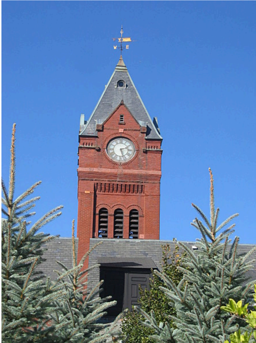
Winchester Town Hall [Wikipedia]

MA, within the Archdiocese of Boston, USA. (The parish was suppressed in 2004).