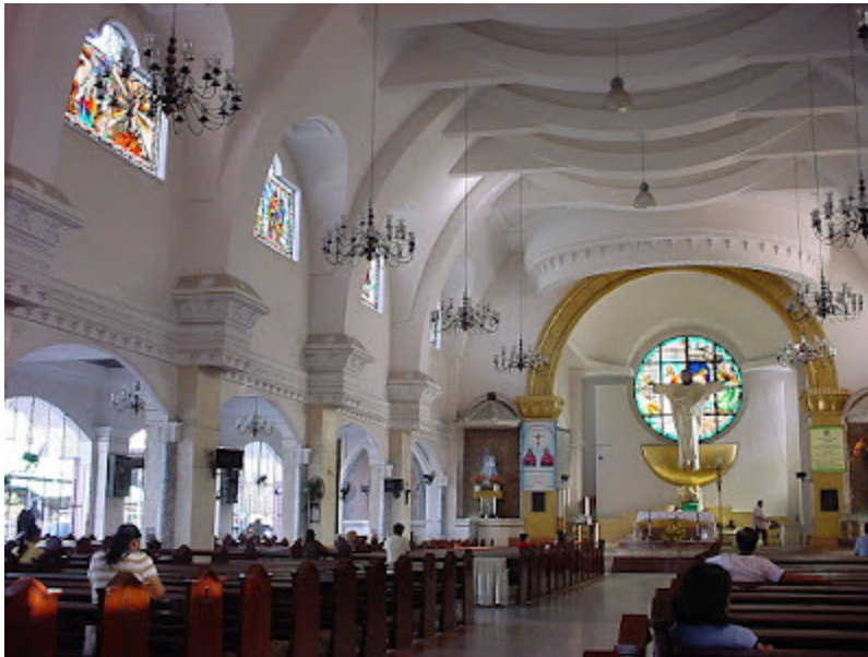
St Michael's Cathedral, Iligan City